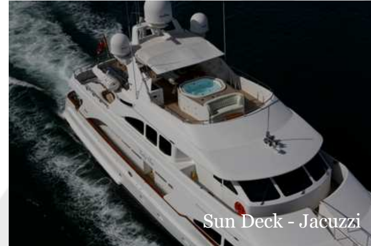
Sun Deck - Jacuzzi